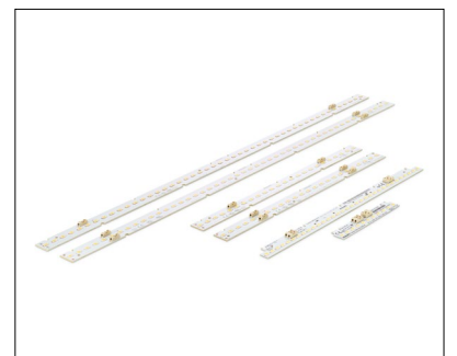
Fortimo LED Strip