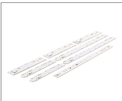
Fortimo LED Line