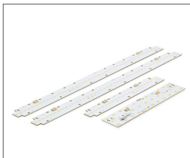
Fortimo LED Line High Flux